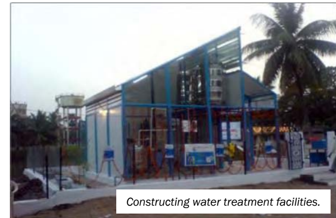
Constructing water treatment facilities.