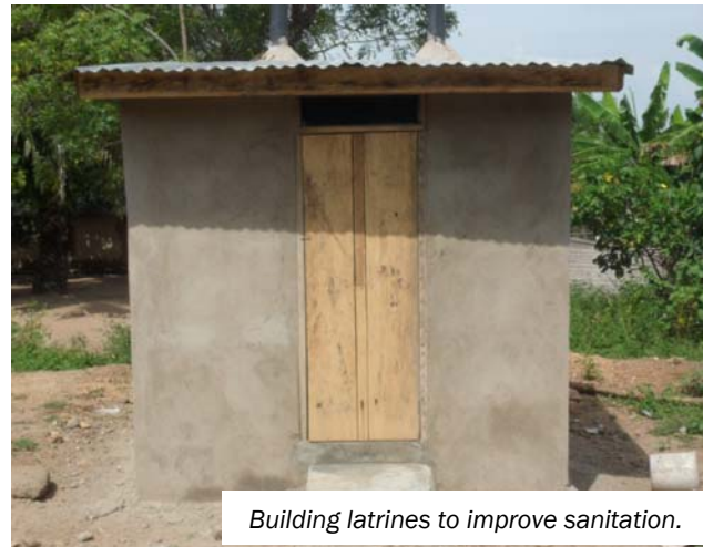
Building latrines to improve sanitation.