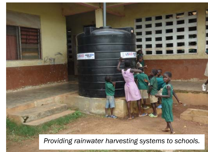
Providing rainwater harvesting systems to schools.