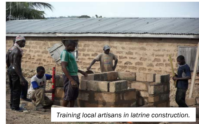
Training local artisans in latrine construction.