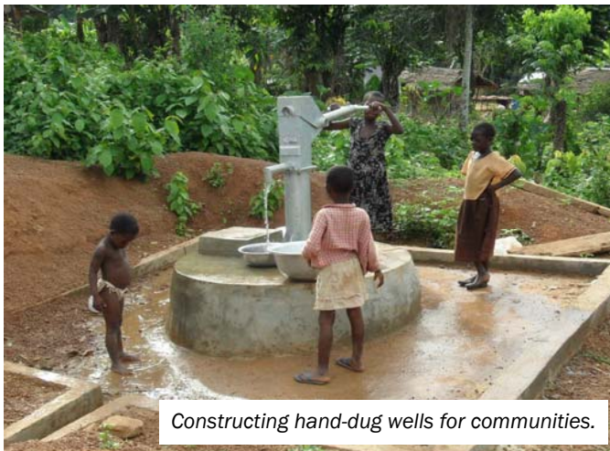
Constructing hand-dug wells for communities.