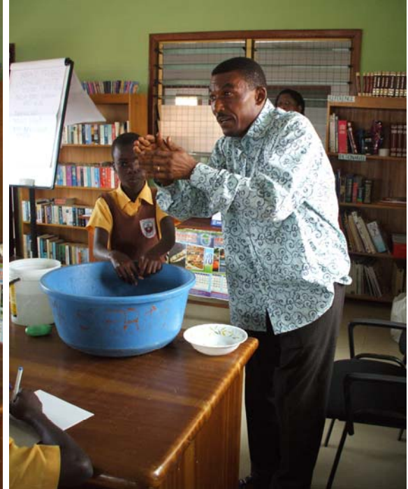
Through WASH education workshops, primary and secondary school students learned about proper toilet usage and hygiene behavior.

The concept for the comic book emerged out of a series of WASH education workshops held at a cluster of schools on the other side of the Greater Accra Region, in an area known as Ledzukuluku Krowor Municipal Assembly (LEKMA). For many of the schoolchildren at LEKMA, lack of access to improved water and sanitation facilities at home, school and in their community is a challenging daily experience. According to the Municipal Assembly, households and communities are regularly confronted by water problems, while a small proportion of households have domestic toilets and public toilets are insufficient in number and poorly maintained. As well, misunderstandings about sanitation and hygiene are common.